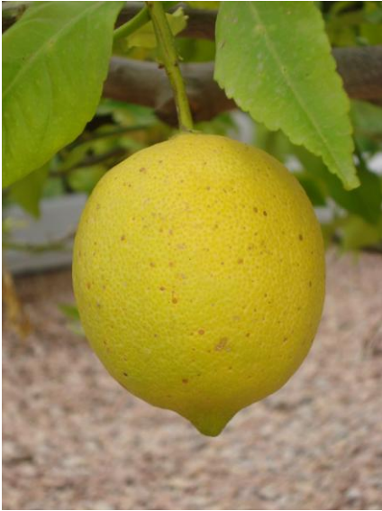
Lemons in garden