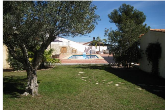
Garden with olivetree