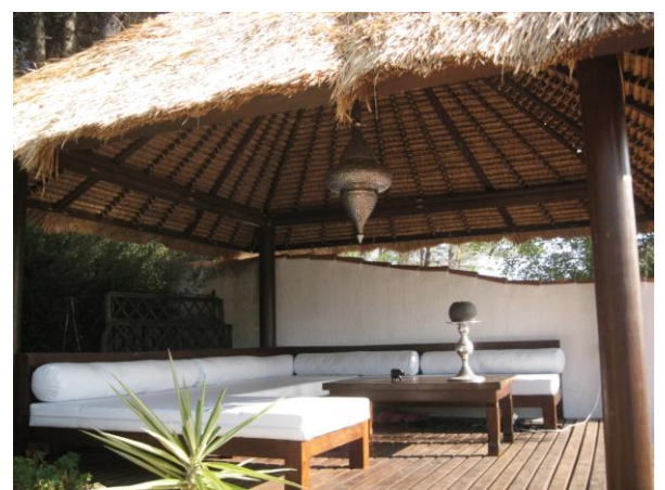
Balinese pagoda with chill-out area